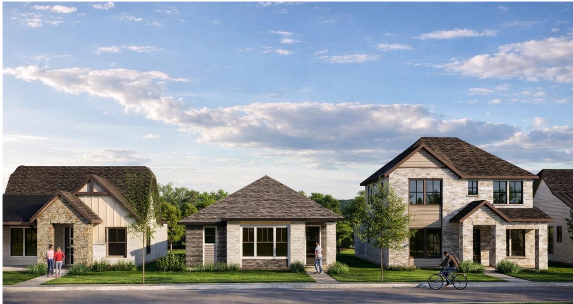
Detached houses for sale (image rendering)

– Our second residential project in the United States –