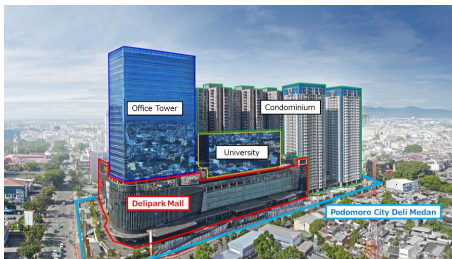
Exterior view of the large-scale mixed-use development “Podomoro City Deli Medan” and “Delipark Mall”

Please refer to the following page for more details on the Property.