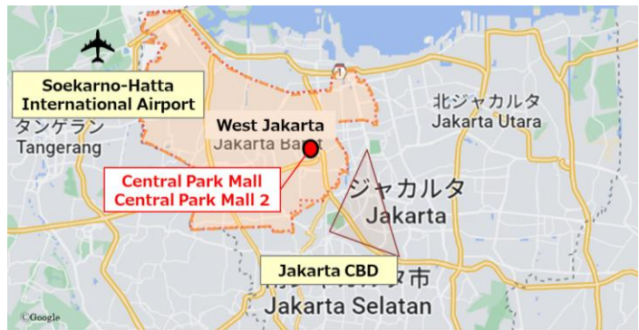
Map of Greater Jakarta Area