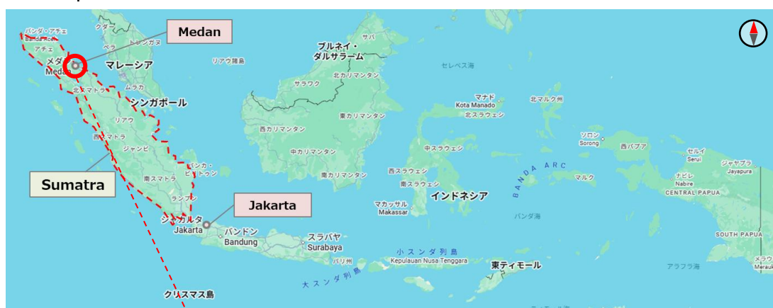
Map of Indonesia