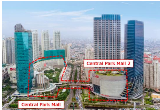
Exterior view of the buildings