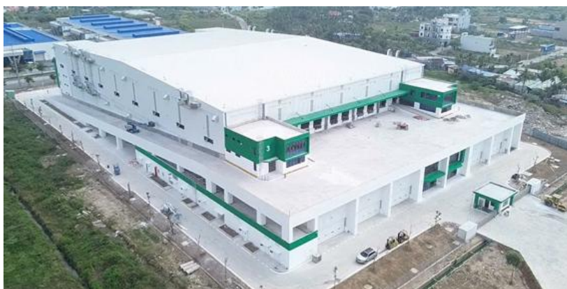
External view of Sembcorp Logistics Park (Thuy Nguyen)