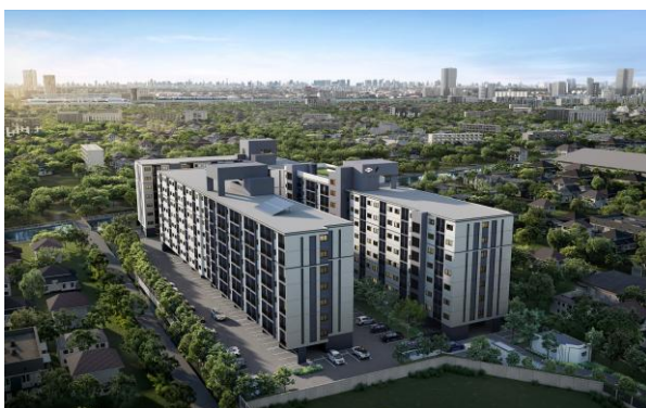
Exterior of “COZI Srinakarin 38” (image rendering)

Details of the “COZI Srinakarin 38” and “COZI Taksin Jomthong” can be found on the following pages.