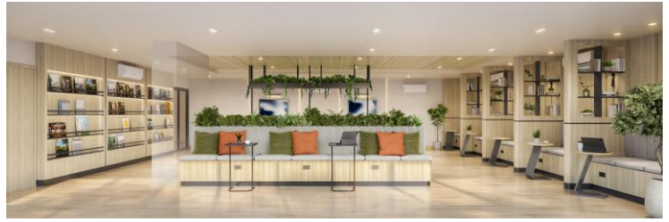
Common Facilities: Working Space (Image rendering)

【Property Type】 Residential Condominium 【Location】 Prawet District, Bangkok 【Site Area】 Approx. 16,600m 2 【Completion】 Sequentially from 2026 (planned) 【Number of Units】 1,161 units