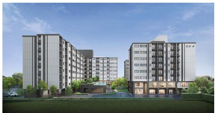
Exterior of “COZI Taksin Jomthong” (image rendering)