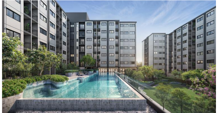
Common Facilities: Swimming Pool (Image rendering)

【Property Type】 Residential Condominium 【Location】 Chom Thong District, Bangkok 【Site Area】 Approx. 6,600m 2 【Completion】 2027 (planned) 【Number of Units】 451 units